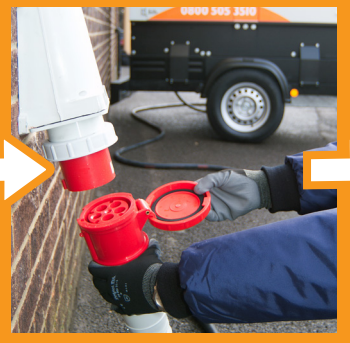
A weatherproof plug and socket provide fast and safe connection to your premises.