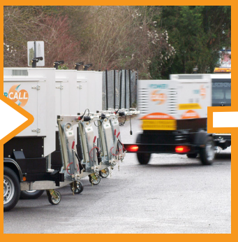
Strategically placed depots around the UK ensure the fastest response times.