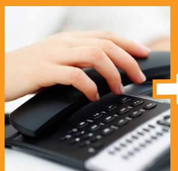
Our 24/7/365 network control room is always on hand to take your emergency call.