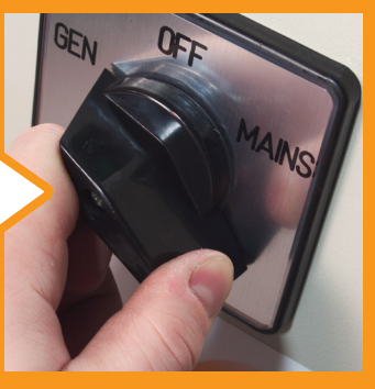
A manual changeover switch allows selection between mains power and generator.